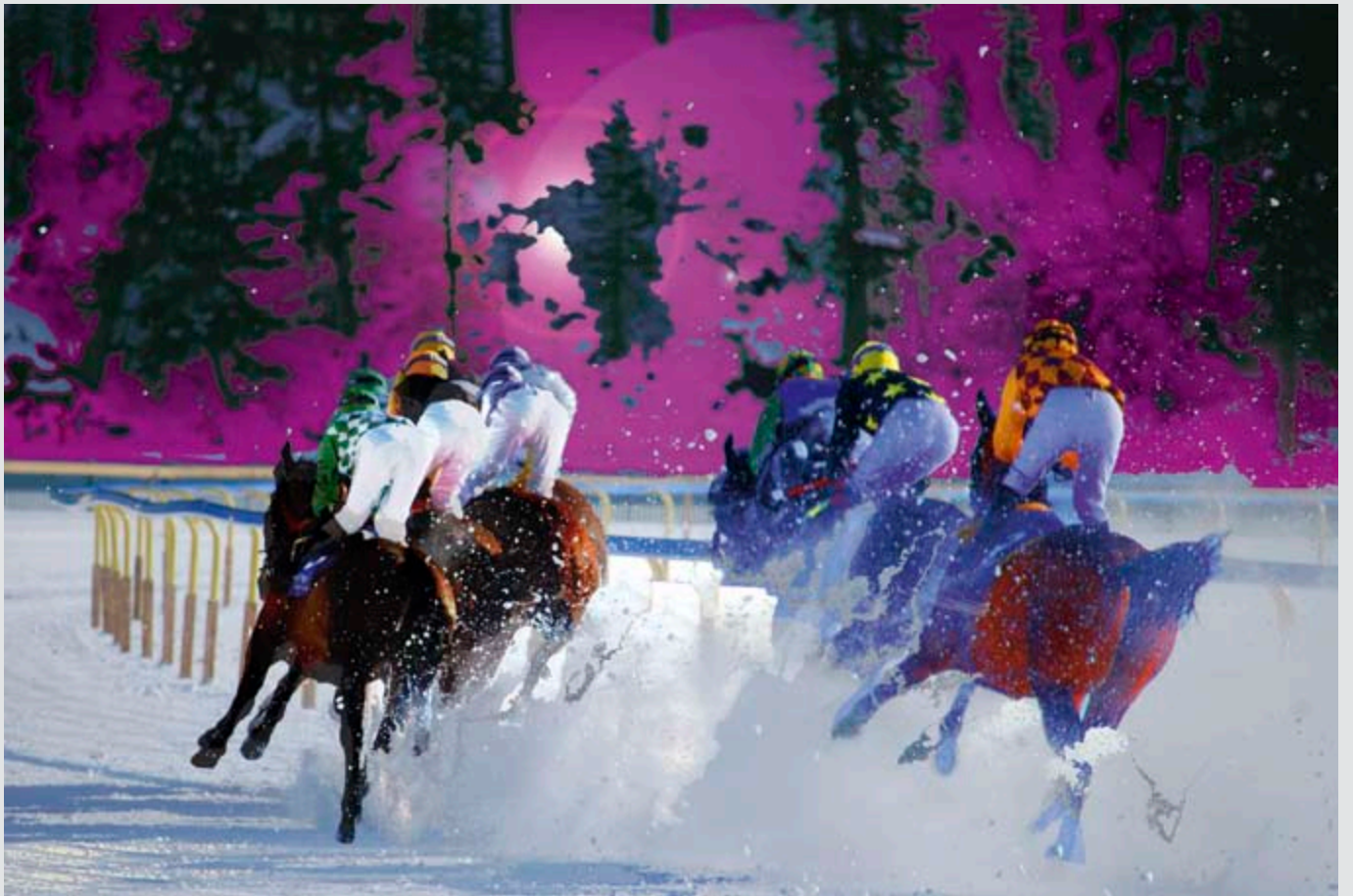
#8 Title: run